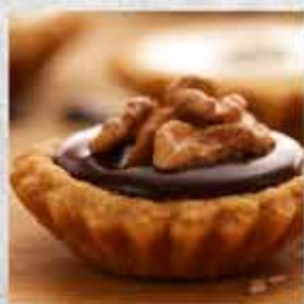
Table Margarine “Sunny Special” 72% is for direct usage and preparation of confectionery and bakery products. It is used in baking and confectionery industry, food concentrates and canning industry, in home cooking and restaurant chains.