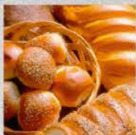
Table Margarine “Stolichnyi Special” 50%, Table Margarine “Stolichnyi Special” 60% shall be used for cooking culinary, flour confectionery and bakery in serial production and also for food consumption in public nutrition chains. Spreading evenly in the dough it gives wonderful taste, ruddy colour and delicate flavor to finished bakery. It allows extending storage terms of finished product. It is recommended for production of low-fat pastries.