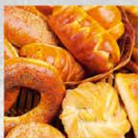
Table Margarine “Milk Special” 82% is used in confectionery, cooking in manufacture of pastry, confectionery, and bakery products. It is also used in food-concentrates industries. Margarine improves the porosity of pastry and bakery products. It distributes evenly in the dough, and improves the process of mechanical handling. It improves the shape and surface of the finished products, increases energy content, helps to preserve freshness, increases the shelf life of finished products.