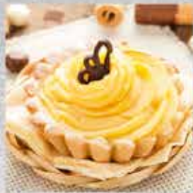
Table Margarine “For cakes” 80% was developed taking into account traditional requirements to production of finishing cream semi-finished products, soufflé. It is recommended to replace dairy butter in receipts of basic creams when developing own receipts. It possesses consistence and fat content of a dairy butter (spread) and can replace dairy butter (spread) in this product segment without loss of quality of the final product.