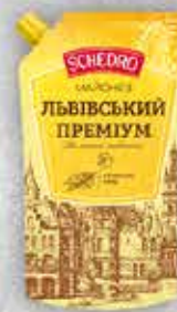
Premium of Lviv