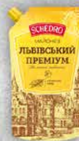
Premium of Lviv