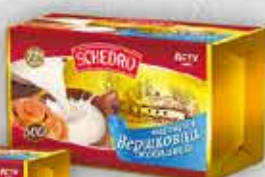
bar 500 g