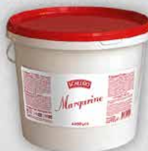
bucket 4,5 kg