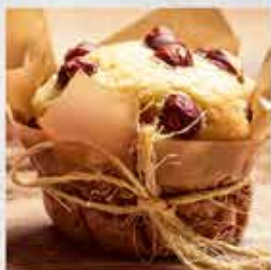
Table Margarine “Gourmet” 40%, Soft Margarine “Gourmet” 35% for the production of cheap flour confectionery products. It has a low fat content and high microbiological stability. It has along shelf life and is optimized for use in production of low-fat confectionery technologies. Uniformly distributed in the dough imparts color and flavor to the finished product. It increases the shelf life of the finished product.