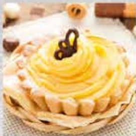
Table Margarine “For cakes” 80% was developed taking into account traditional requirements to production of finishing cream semi-finished products, soufflé. It is recommended to replace dairy butter in receipts of basic creams when developing own receipts. It possesses consistence and fat content of a dairy butter (spread) and can replace dairy butter (spread) in this product segment without loss of quality of the final product.