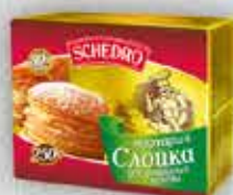
briquette 250 g